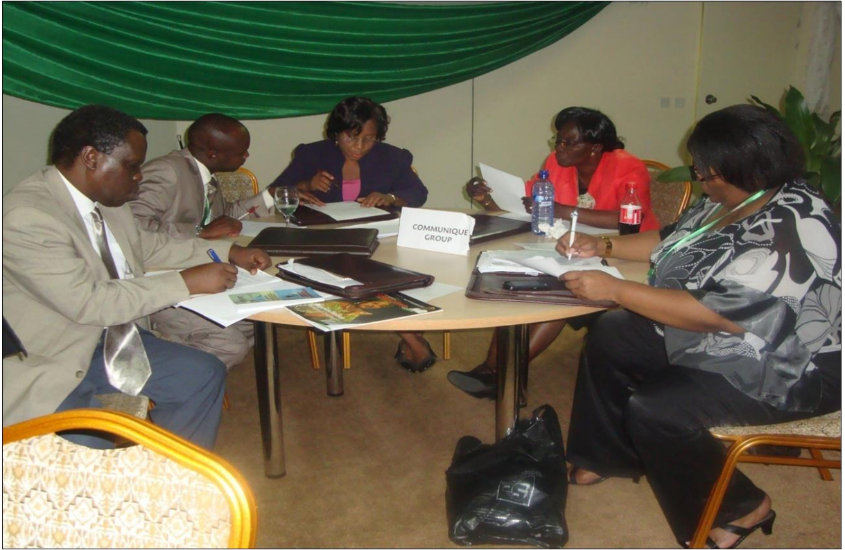
The communiqué team at 1 st AFTRA Roundtable