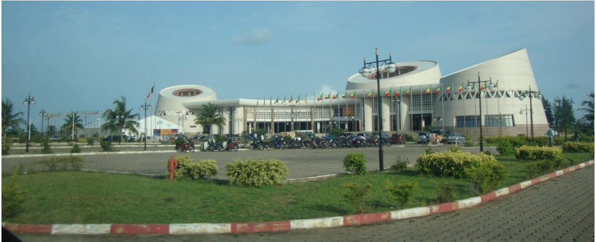
Below: Venue of 1 st AFTRA Conference and the conference in action ...