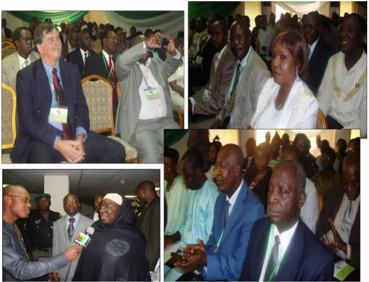
Delegates at the AFTRA inauguration