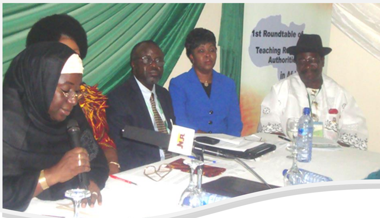
Nigeria's Minister of Education, Professor Rukayyatu Ahmed Rufai, inaugurating AFTRA on October 12, 2010.