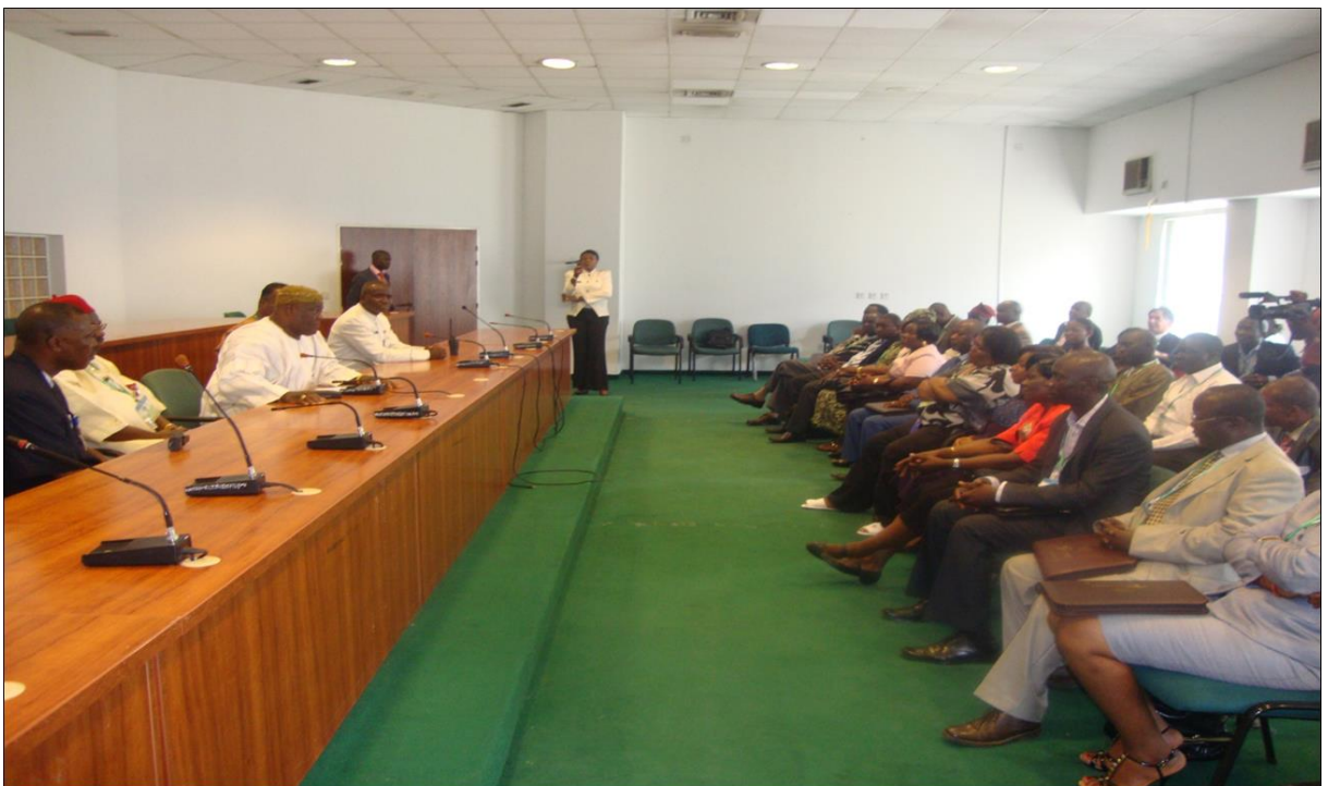
AFTRA Delegates were welcomed and endorsed by Nigeria's National Assembly