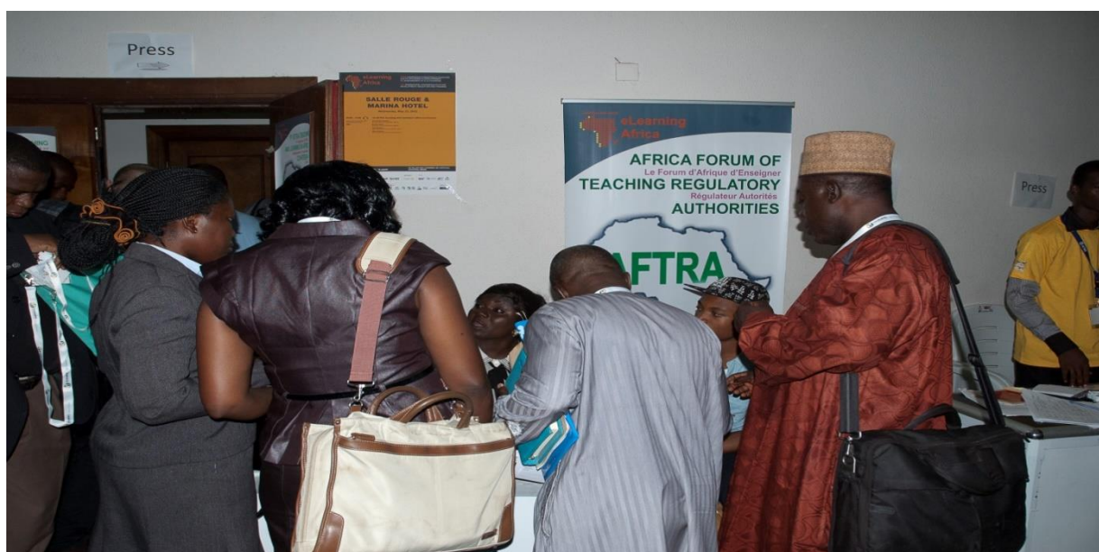
Participants registering at 1 st AFTRA International Conference in Republic of Benin, 2012