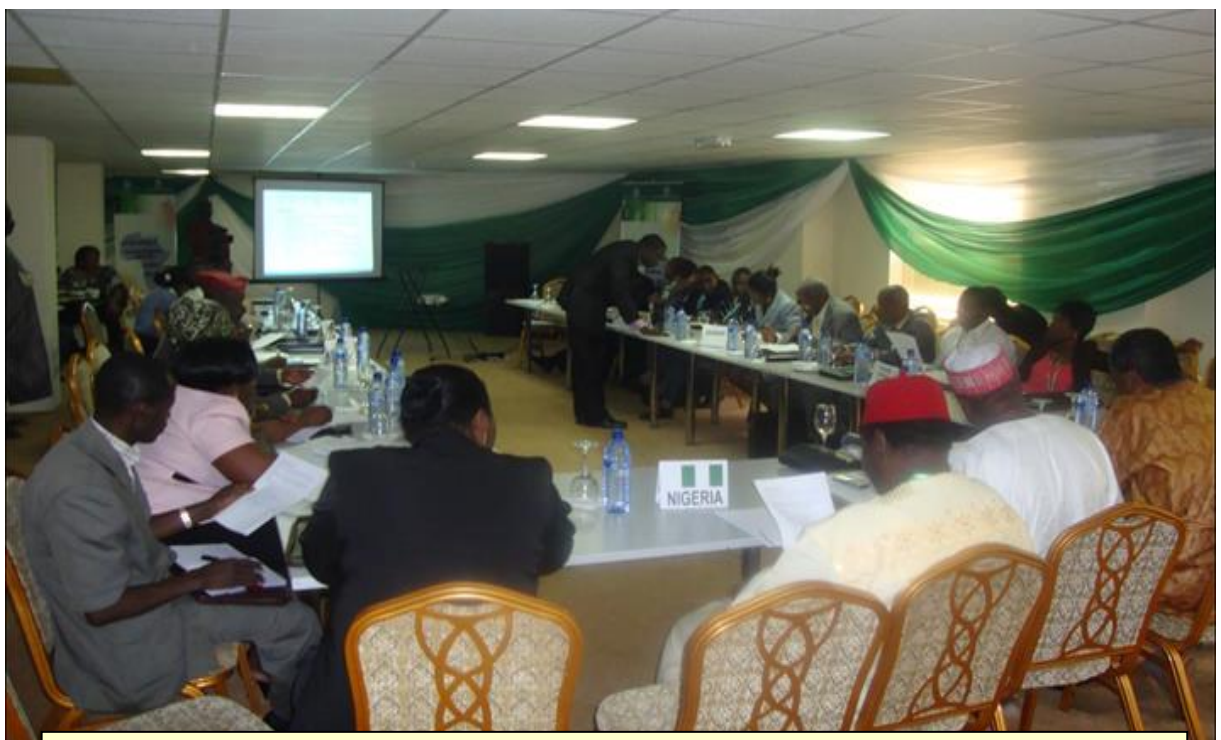
AFTRA first plenary session immediately after its inauguration in 2010