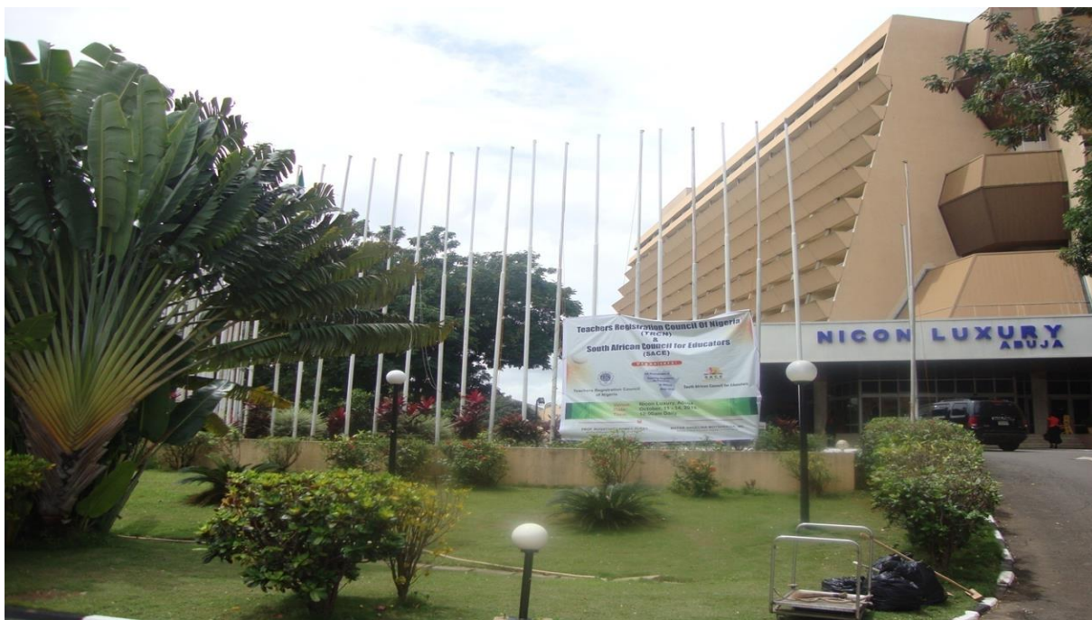
Nicon Luxury Hotel Abuja, venue of AFTRA's inauguration & 1st Roundtable