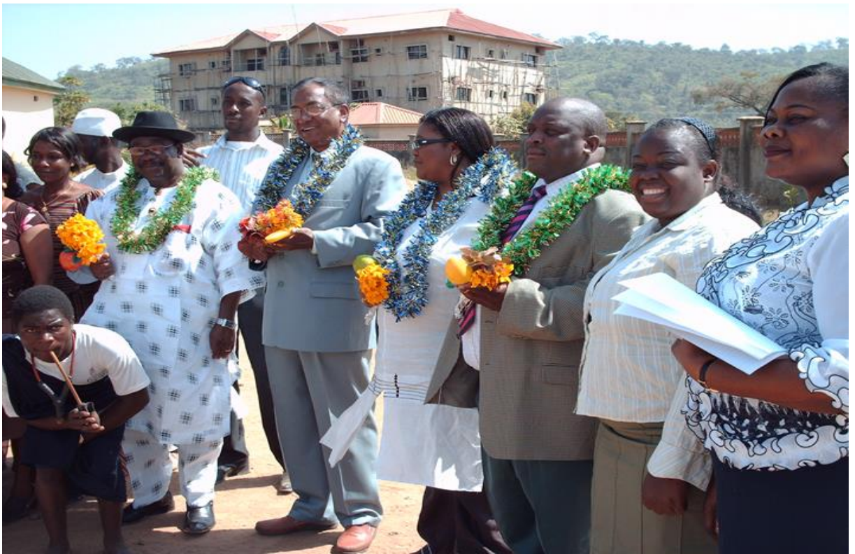
SACE team's special welcome by school children in Abuja, 2009