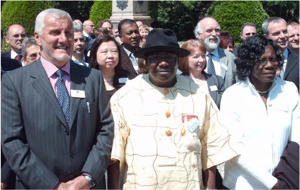
Delegates at the 2009 IFTRA Conference in Wales, UK with the Chief Executive Officers of TRCN and SACE present