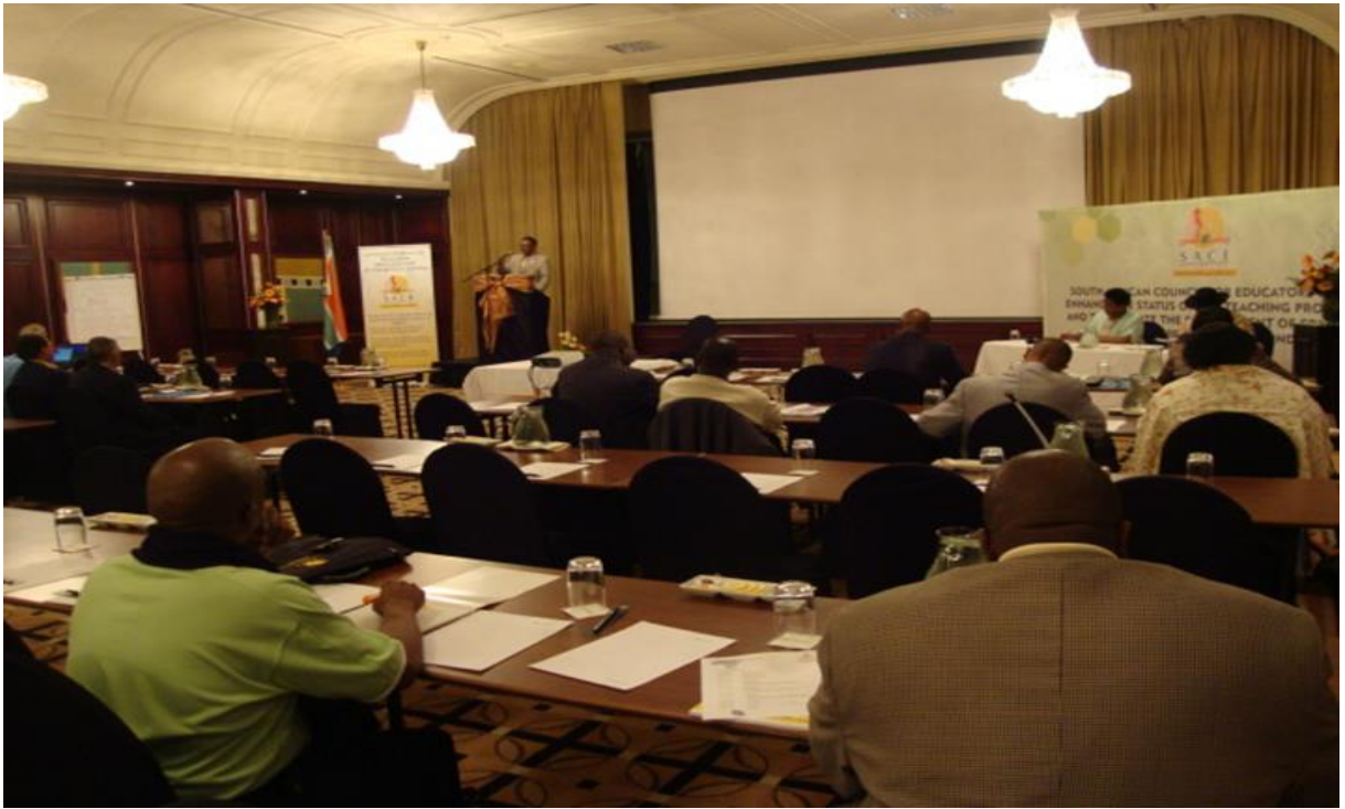
AFTRA conference in the beautiful city of Durban, South Africa hosted by SACE, 2011

This followed the inability of Sudan to host due to armed conflict in the country. SACE hosted both AFTRA and IFTRA conferences back to back in Durban, South Africa