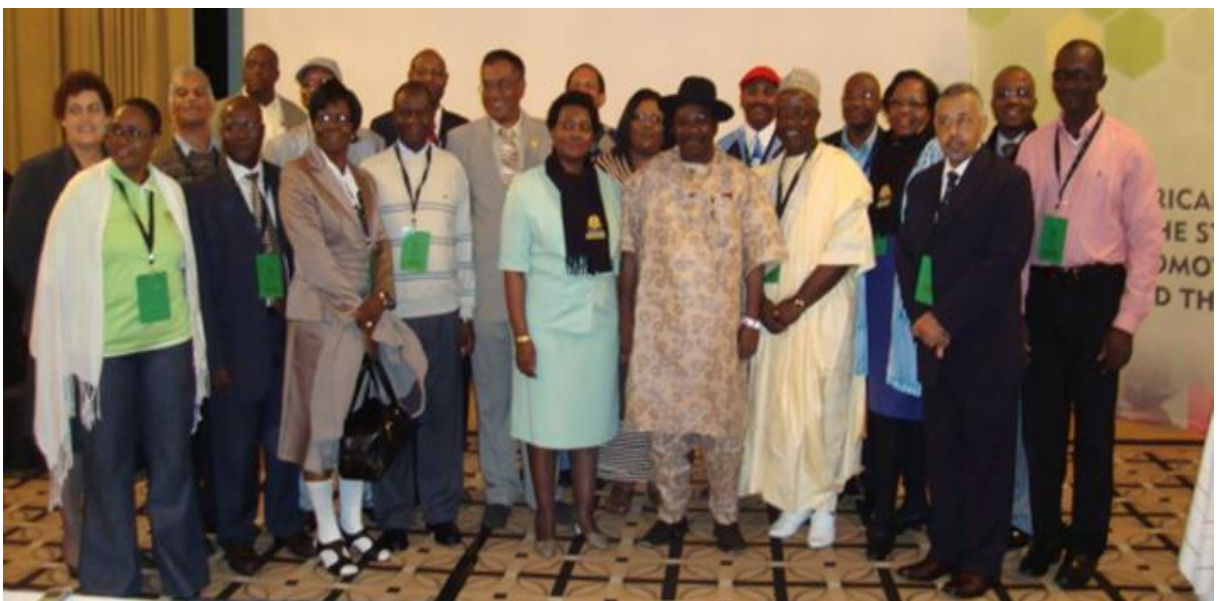
In 2011: A section of AFTRA delegates in South Africa