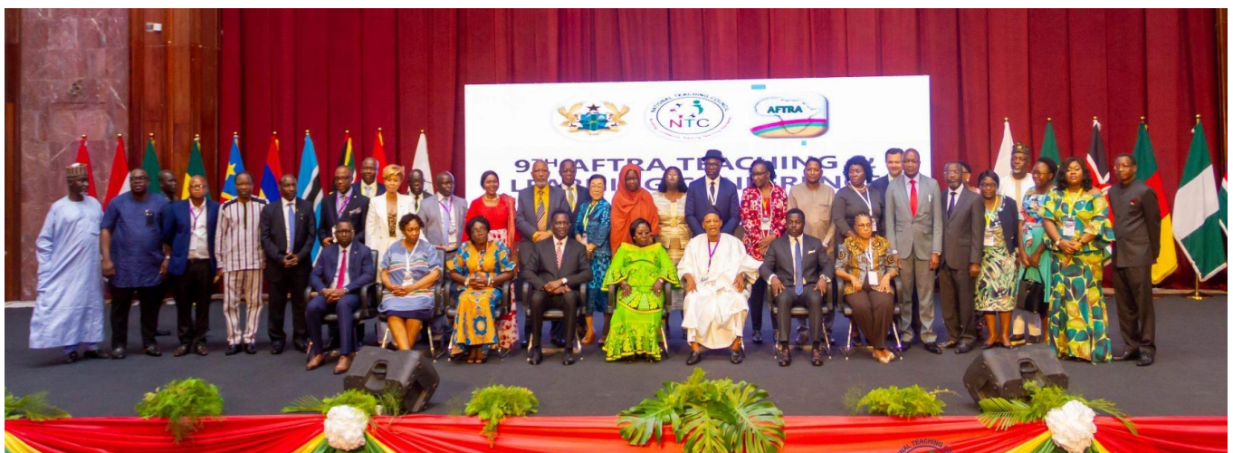
Ministers of Education and Dignitaries' photo session @ Ghana 2022