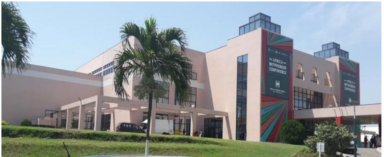
International Conference Centre, Accra Ghana