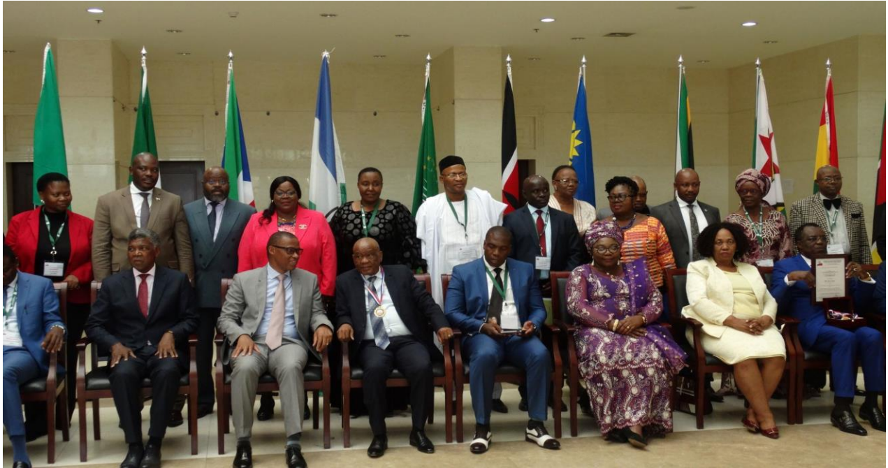
Photo: Dr. Motsoahae Thomas Thabane, The Right Honourable, Prime Minister of Lesotho; Ministers of Education; AU HRST Commissioner; and other dignitaries at the 10th AFTRA Anniversary in Maseru, Lesotho, 2019